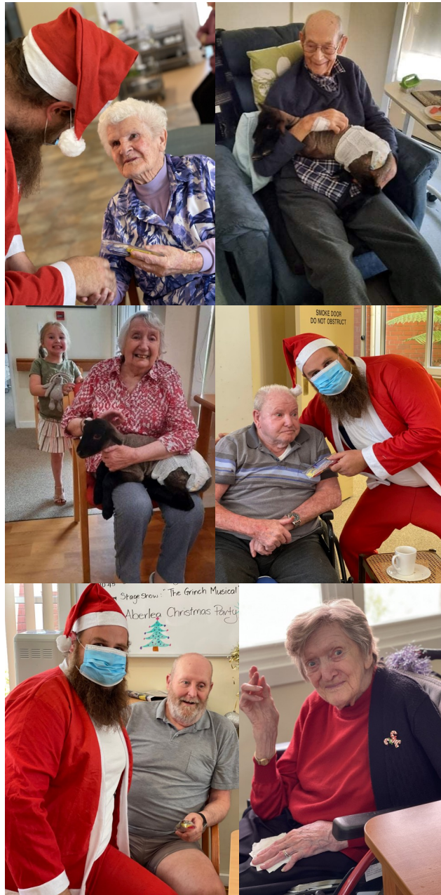
Staff performed '12 Days of Christmas' for the residents.

Aberlea residents enjoyed preparations for Christmas week as well as visits from friends, family, furry friends and Santa.